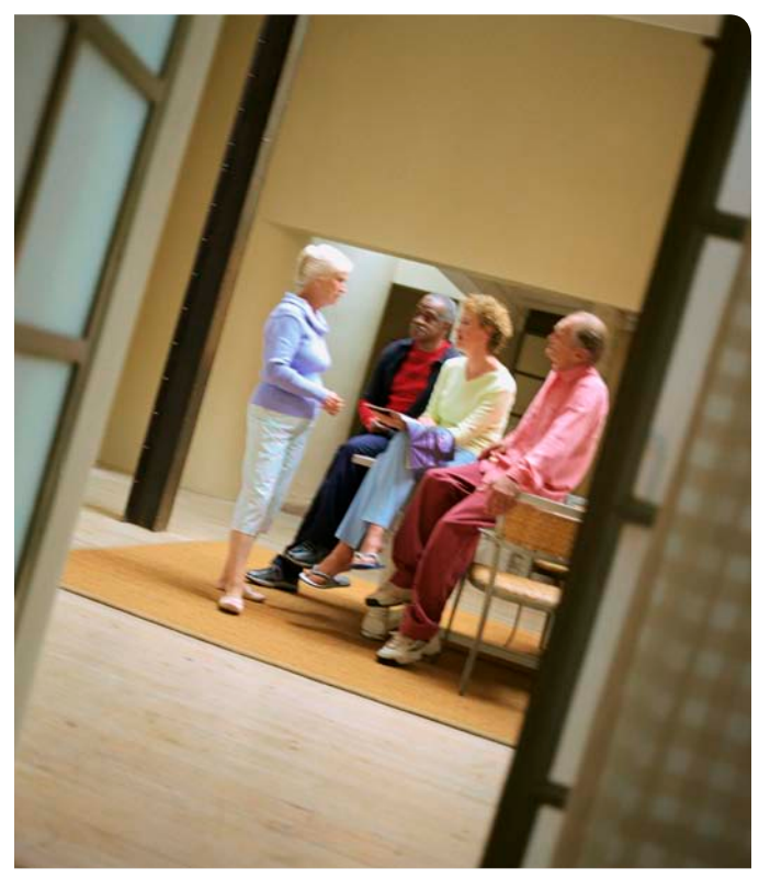
Connecting with friends or joining a stroke support group may help you cope with your changing emotions.